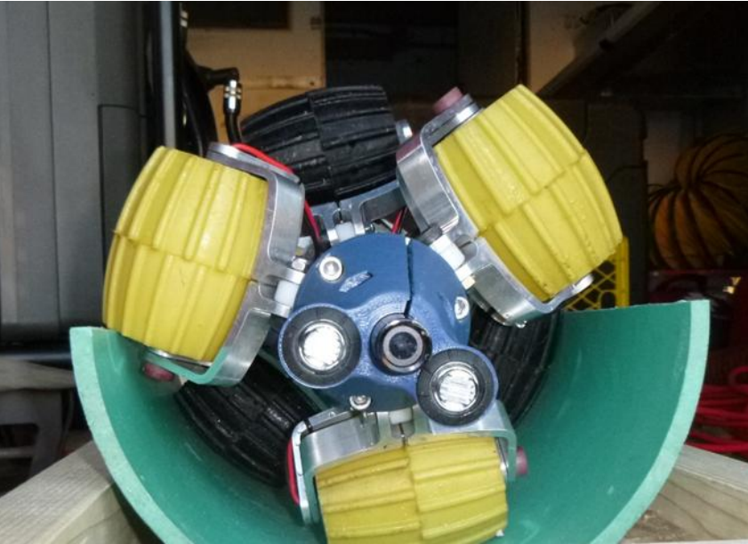
Figure 2 - The Asbestos Cement Pipe Scanner