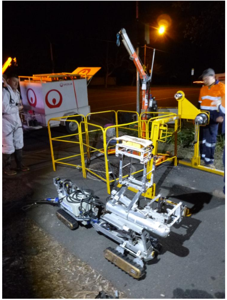
Figure 1 - The SewerVUE Surveyor robot on-site in Melbourne, Australia

Following completion of data collection comes data interpretation. PPR data interpretation is a critical step if meaningful information is to be drawn from the survey. SewerVUE uses proprietary software to apply different correction, filter, and gain functions to the PPR data. This processing enhances anomalies and allows for clearer interpretation of the results. Proper interpretation of PPR data is enhanced by the construction of a good threedimensional display. Anomalies or points of interest are far easier to locate on a three-dimensional data set compared to a two-dimensional set. The final PPR data interpretation is superimposed over actual depth profiles versus distance.