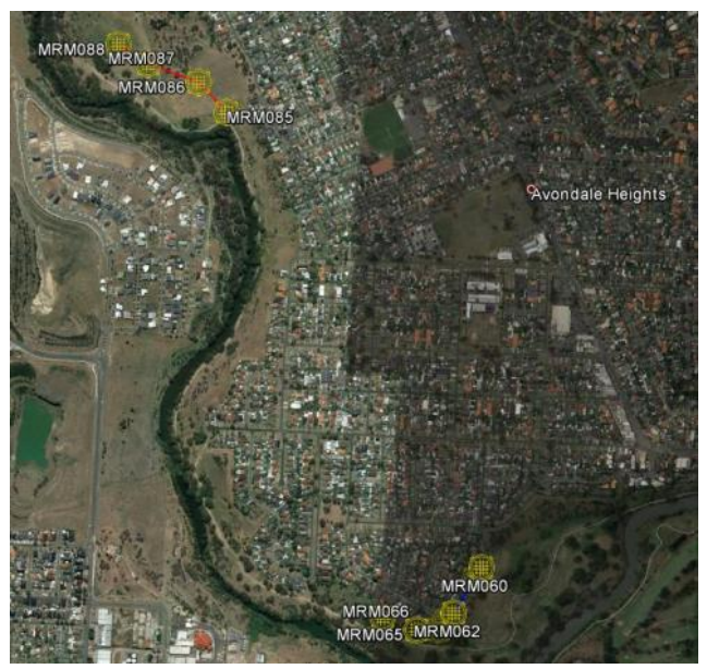
Figure 6 - Map showing locations of both Maribyrnong main inspection areas.