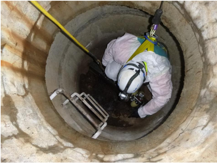
Figure 3 - A SewerVUE technician places the ACPS into the Harbourgreene line.

The Harbourgreene line in Surrey, BC, Canada is an asbestos cement pipe that was installed in 1972. Currently there are no known corrosion issues; the initial inspection will serve as a baseline. The pipe is inspected regularly using traditional CCTV. The City has partnered with SewerVUE to conduct a high-frequency PPR survey to inspect sections of the Harbourgreene line in order to obtain structural condition information. This project's PPR survey was completed using high-frequency antennae while the pipe remained in service. 2D line data were collected on the invert of the pipe. The high antenna frequency provided good quality data and signal penetration to allow analysis to a depth of 300 mm from the inside pipe wall surface (Figure 4).